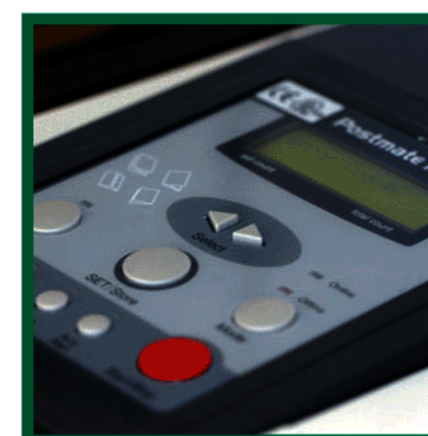
User friendly interface