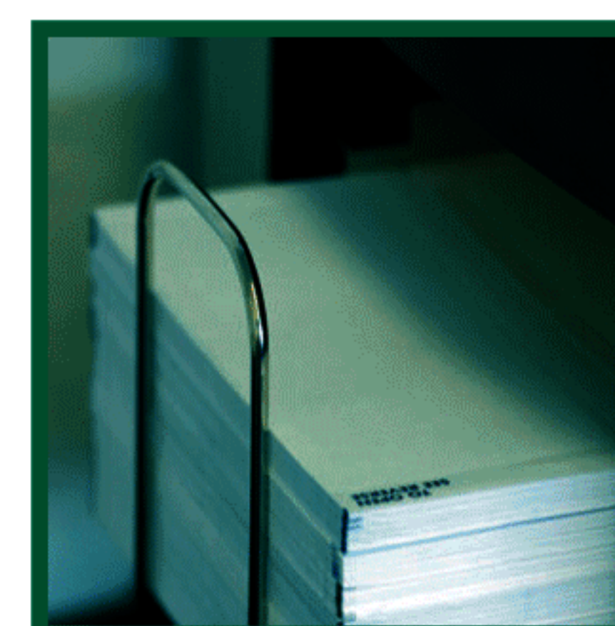
High capacity In-feed tray