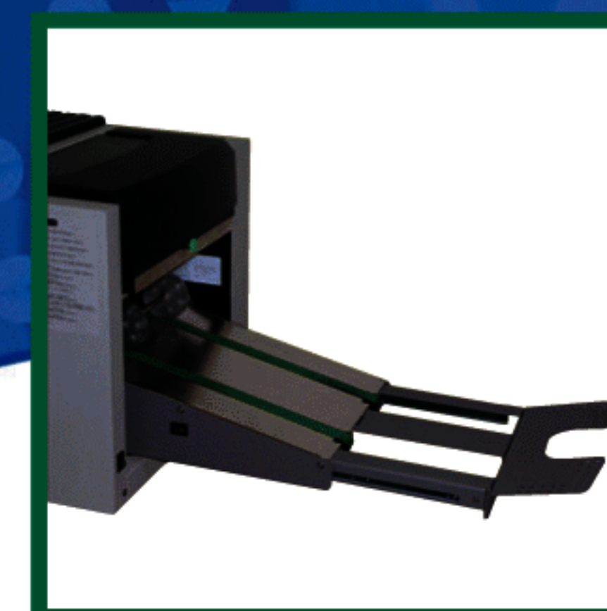
Optional automatic extending conveyor activated by the number of forms processed